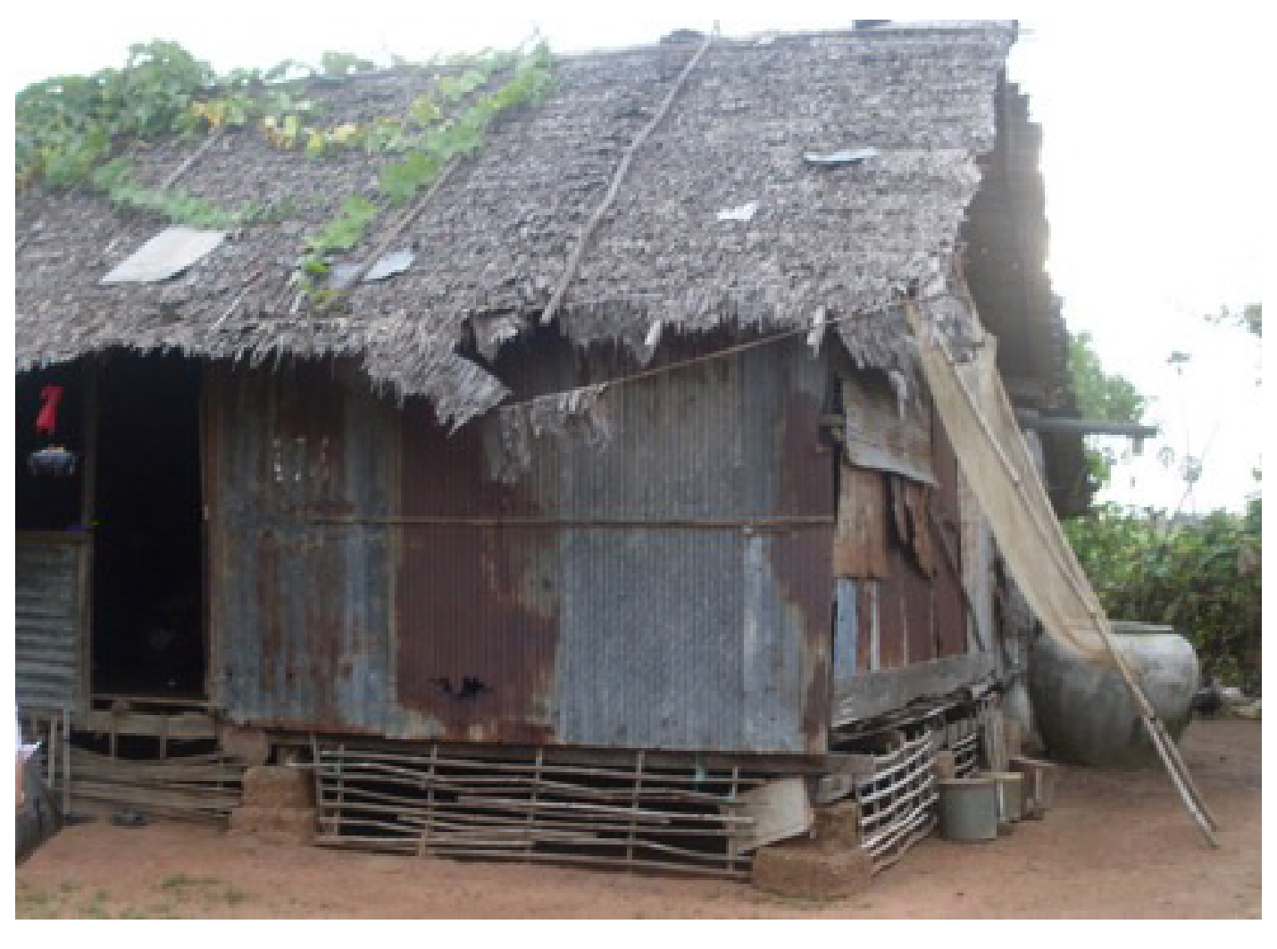
Girls in Lotus Outreach Australia's GATE program come from some of the poorest homes in Cambodia.